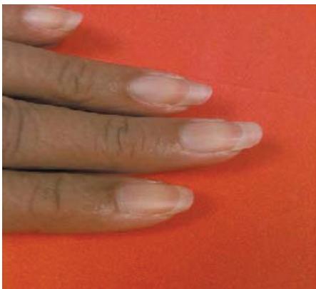
Figure 1. Discoloration of the nail with a proximal white portion and a distal reddish-pink to brown portion (From Markova A, Lester J, Wang J, Robinson-Bostom L. Diagnosis of common dermatopathies in dialysis patients: A review and update. Semin Dial. 2012;25(4):408-418, with permission)

Half and half nails, also called Lindsay's Nails, are said to be found in as many as 21% of patients on dialysis(1). They appear as a discoloration of the nail with a proximal white portion and a distal reddish-pink to brown portion (Figure 1) (1). The discoloration does not change with nail growth, indicating the problem begins in the nail bed. The discoloration also does not fade with pressure. The exact pathophysiological mechanism associated with half and half nails is not understood, but an increase in the number of capillaries and capillary wall thickness has been observed in the nail bed (2). It can be found at any level of azotemia, and does not improve with dialysis; however, it does sometimes improve (and even disappear) with kidney transplantation (3,4).