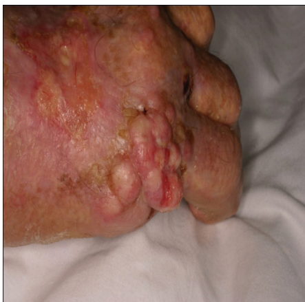
Figure 5. Non-melanoma skin cancer (From Phillips, C. East Carolina University Department of Dermatology, with permission).

immunosuppression, and the incidence of NMSC is up to 20-fold greater in renal transplant recipients when compared to the general population (13). Of the two most common NMSC histological types, squamous cell carcinoma (SCC) is typically more aggressive, recurrent, and metastatic than basal cell carcinoma (BCC). SCC also happens to be more common in the renal transplant population (Figure 5). Localization of this cancer to sun-exposed skin, including the head and face can require complex surgical procedures (14). Risk factors for NMSC's in renal transplant patients include dosage and duration of immunosuppression, older age (>55 years), male sex, white skin, history of skin cancer prior to transplantation, lower peak panel reactive antibody (PRA) level, and less-well defined genetic factors. 16 High risk patients and clinicians should have a high suspicion for NMSC in their transplant patients, and be especially aware of pre-malignant skin lesions as well, including Bowen's disease (in situ SCC) and actinic keratosis. Full-body skin examination can help to identify these lesions early. Patients should be taught to routinely perform self-examinations, and full body skin checks should be incorporated into regular post-transplant follow up appointments (13).