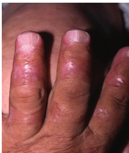
Figure 3. Nephrogenic systemic fibrosis (NSF) [From Phillips, C. East Carolina University Department of Dermatology, with permission].

a patient with any gadolinium agent exposure has been reported to range 1.13-3.4%, making it a rare entity (4). To diagnose NSF, a scoring system of clinical and histopathological criteria has been used. Several pathophysiological mechanisms have been proposed, and it appears to be related to increased collagen deposition, with fibrosis occurring in multiple organ systems, including the lungs, heart, and liver (9). Unfortunately, there is also no effective treatment for NSF. Topical or systemic corticosteroids, cyclophosphamide, thalidomide, plasmapheresis, immunoglobulin infusion, imatinib mesylate, and rapamycin have been reported to offer some improvement. Prevention of this disease is most important, including avoidance of triggers. Gadolinium agents should only be used in patients in ESRD when absolute necessary (4).