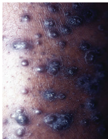
Figure 4. Acquired perforating dermatosis (From Phillips, C. East Carolina University Department of Dermatology, with permission).

A subset of APD, acquired perforating dermatosis of hemodialysis is characterized by hyperkeratotic papular lesions (Figure 4). They occur predominantly on the trunk and extensor limb surfaces (2). The incidence in North America ranges between 4.5-10% of patients receiving chronic hemodialysis, however, APD in ESRD has been reported in transplant recipients, and in CKD patients not yet on dialysis, as well (2,11). Although the exact pathophysiological mechanism for APD in ESRD is unknown, it is thought to be the result of dermal connective tissue dysplasia and decay (11). Local trauma and necrosis of the dermal changes layer may be secondary to trauma to the skin induced by frequent scratching by patients with pruritus from CKD (1,12). The lesions of APD may resolve spontaneously. When treatment is desired, topical retinoids, topical and intradermal steroids, and UVB light have been tried with variable results (1).