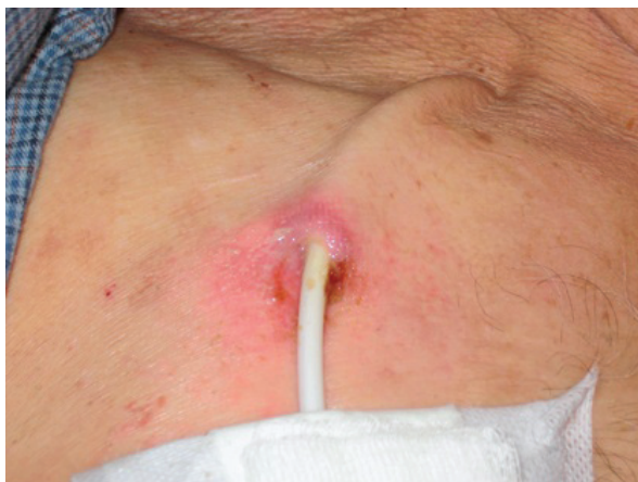
Figure 6. Access site infection (From Lok CE, Mokrzycki MH. Prevention and management of catheter-related infection in hemodialysis patients. Kidney Int. 2011; 79(6):587-598, with permission).