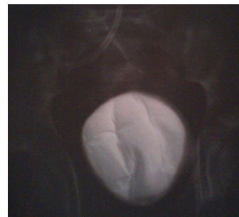
Figure 3. Retrograde cystography of patient that with two arteries originated from aorta.