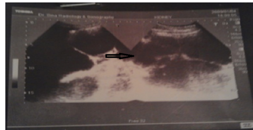
Figure 1. Ultrasonography of patient with cystic right kidney.

The horseshoe kidney is the most common of all renal fusion anomalies. Horse shoe kidney occurs in 0.25% of the population, or about 1 in 400 persons (1). Previously, up to one-third of individuals with horseshoe kidney had hydronephrosis secondary to UPJ obstruction (8). In the modern era, horseshoe kidneys are frequently discovered incidentally, and their