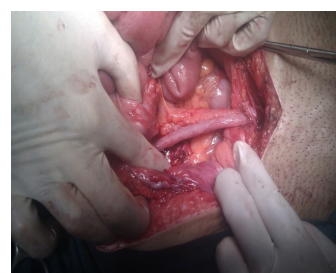
Figure 4. Appendix position in horseshoe kidney.

apparent hydronephrosis often shows a non-obstructed pattern on radionuclide scanning (9). The indications for curing obstruction in horseshoe related UPJO are the same as other UPJO conditions, impairment of overall renal function or progressive impairment of ipsilateral function, development of stones or infection, or, rarely, causal hypertension. Gold standard of surgery for UPJO is dismembered pyeloplasty surgery, however less aggressive endourologic procedures may have a role in these patients (10). Dismembered pyeloplasty is not well suited to UPJ obstruction associated with lengthy or